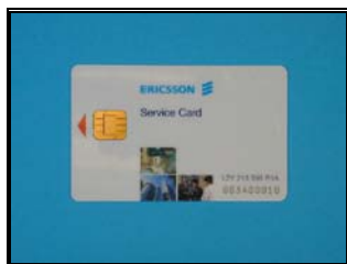
Smart Card (8)