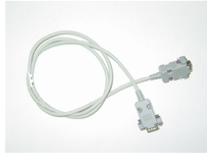
Serial Cable(CSA LL64151-A)