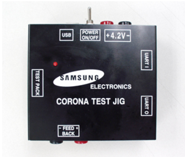
Test Jig (GH80-03306A)