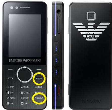
Picture 1. Download Mode.